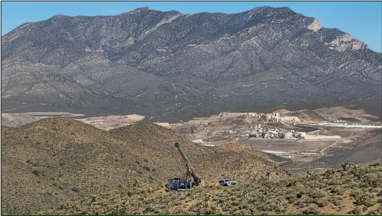
Figure 1: Photo of the drilling operations at El Campo with the Mountain Pass REE mine in the background.